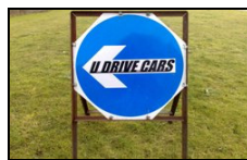
UDC Direction Sign